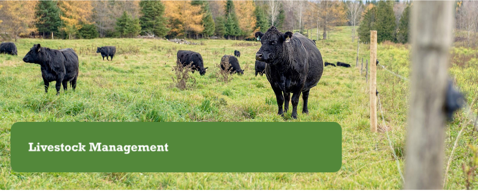
Grazing cattle at Local Valley Beef in Fredericton, NB

Ruminant livestock – such as cattle, sheep and goats – have microbes in their guts that produce methane. The emissions that come from the mouths of ruminant livestock are known as enteric methane, and are the largest single source of emissions in Canadian agriculture, with cattle accounting for the very large majority of enteric emissions. Improving diet quality can directly reduce enteric emissions, and can also lead to faster growth, better animal health and better reproductive success, all of which lower the emissions intensity of the animal products produced. Improved grazing practices can increase soil carbon sequestration, which reduces atmospheric carbon and provides numerous soil health benefits. The emissions reduction opportunities described in this section are extremely cost-effective.