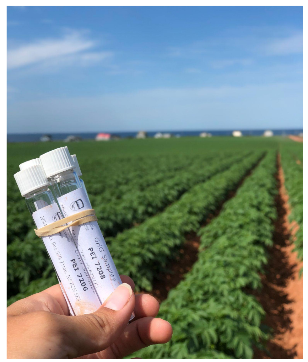
GHG research on a PEI potato farm.

The APF Task Force identified 19 BMPs across five categories that are practical, implementable and proven to provide cost-effective GHG mitigation. The following section summarizes the findings detailed in the emissions, economics and programs reports for each BMP.