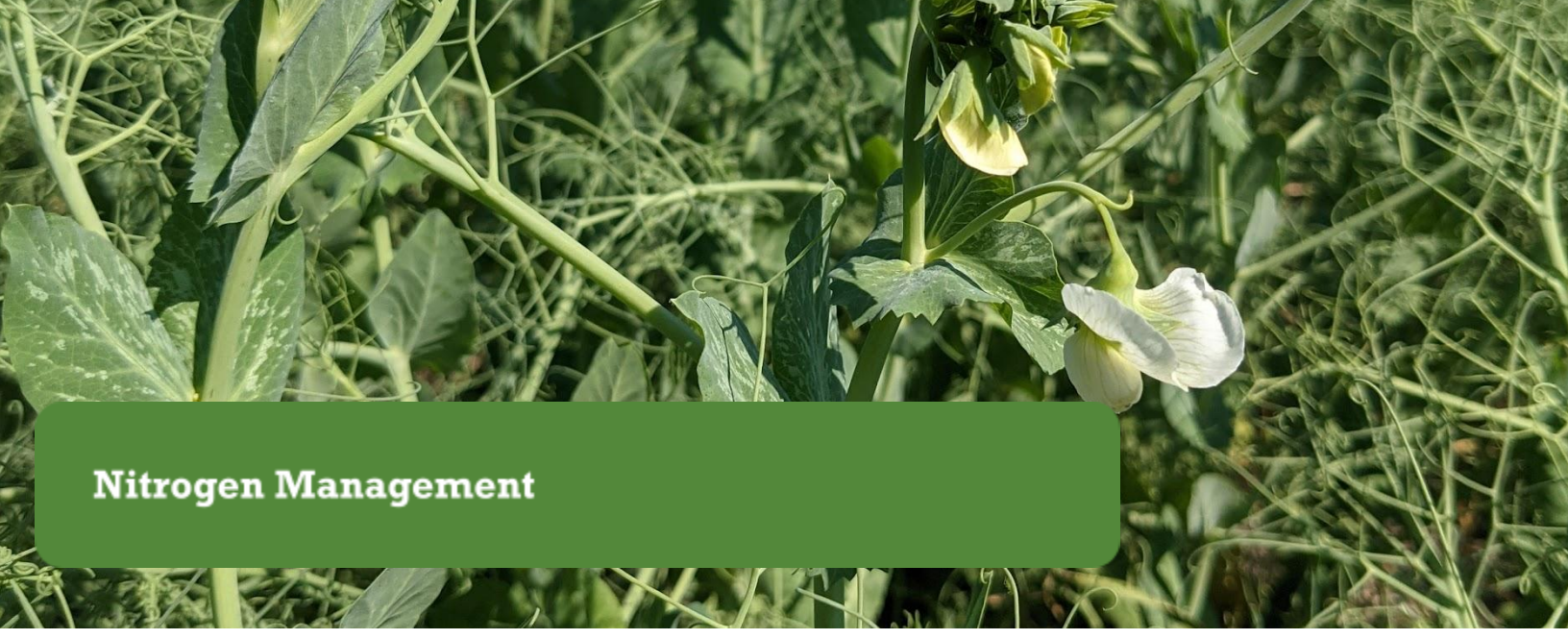
Field peas at Faspa Farm in Manitou, MB

Direct greenhouse gas emissions from the use of nitrogen fertilizer represent approximately 14% of all emissions from Canadian agriculture, and are the fastest growing source of emissions. The government of Canada has set a target of a 30% absolute reduction in emissions from nitrogen fertilizer by 2030. Supporting the adoption of the four BMPs related to synthetic nitrogen fertilizer management recommended in this report would result in a 3.5 Mt absolute reduction in nitrogen-related emissions in 2030, 33% below current levels. Additional reductions can be achieved through better management of organic sources of nitrogen, especially manure.